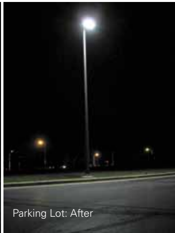
Parking Lot: After