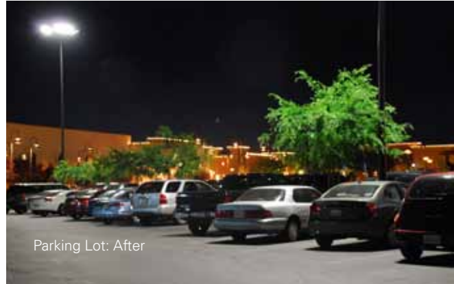
Parking Lot: After