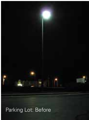
Parking Lot: Before