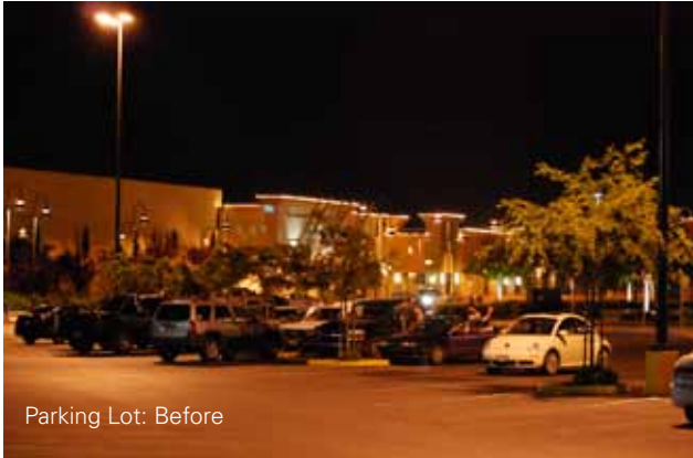
Parking Lot: Before